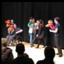
Addy & Uno Puppet Show

In addition to film, ReelAbilities also presents special collaborative programs such as art exhibits, dance performances, live music, comedy shows, workshops, panel discussions on fashion, music, art, design, beauty, and much more, creating a week-long celebration of culture.