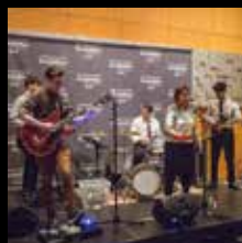
The Merry Rockers Band