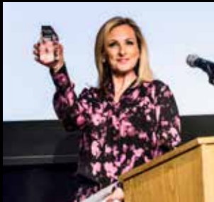
Marlee Matlin (Actor)