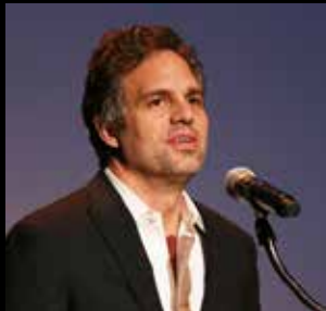
Mark Ruffalo (Actor)