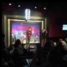
ReelAbilities Comedy Night