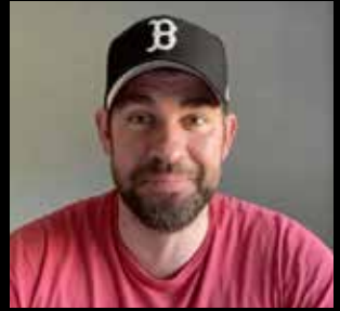
John Krasinski (Director, A Quiet Place , Actor, The Office )