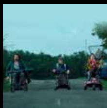
Kills on Wheels