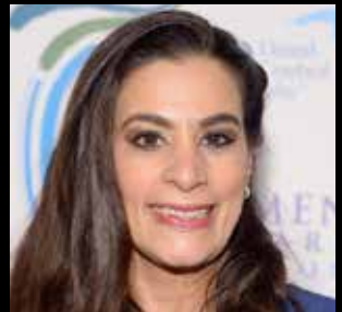
Maysoon Zayid (Comedian, Activist)