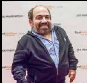
Danny Woodburn (Comedian, Actor, Seinfeld )