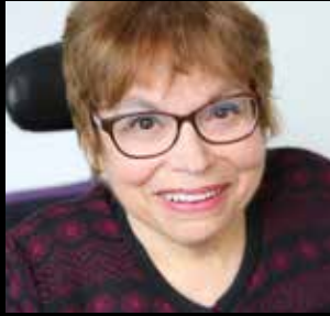
Judith Heumann (Activist)