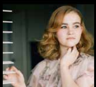
Millicent Simmonds (Actor, A Quiet Place )