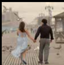
Keep the Change