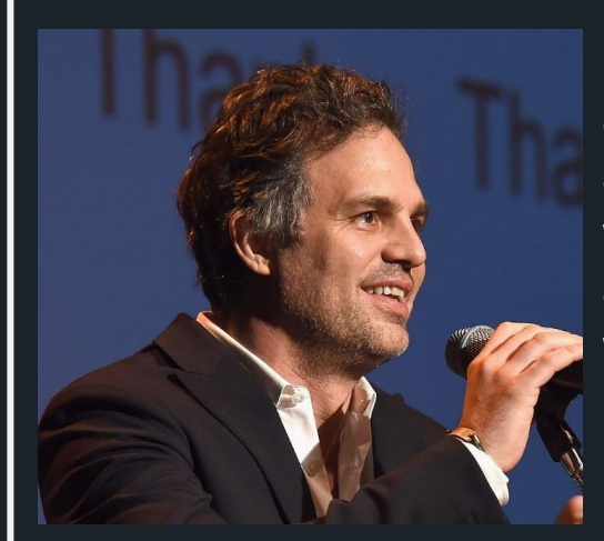
Mark Ruffalo Actor + Humanitarian

"Film festivals like ReelAbilities are a platform for artists to be able to bring another look at the world, another point of view, and launch that into the world...ReelAbilities Film Festival is such an important vehicle."