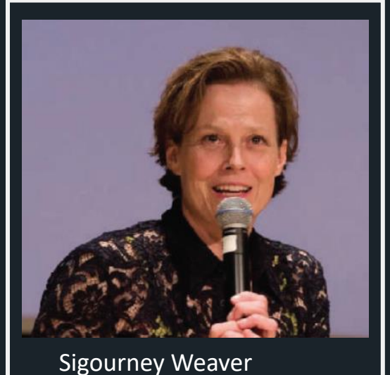
Sigourney Weaver Actor

"Film festivals like ReelAbilities are a platform for artists to be able to bring another look at the world, another point of view, and launch that into the world...ReelAbilities Film Festival is such an important vehicle."